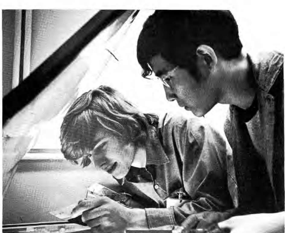
UNUSUAL APPLICATIONS of rolamite technology caught the attention of these two students, among the 200 senior science students from high schools in Albuquerque and nearby communities.